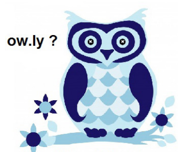
Shortened links make it easier for readers to copy a link from the printed newsletter into a browser on a computer or mobile device.

Thanks to work from many activists there will be no more microbeads from facial cleansers or body washes contaminating our rivers, lakes and oceans! http://ow.ly/XbHIR